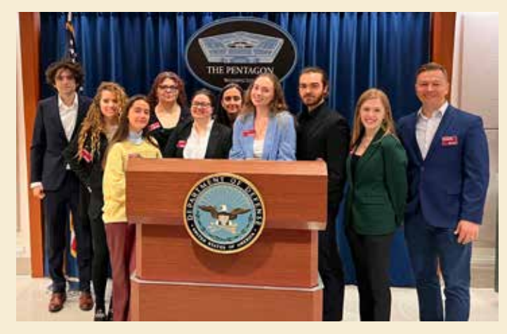
Visit to the Pentagon and National Guard Bureau

After eating, exploring, and learning together, we all discovered something new. This once-in-a-lifetime trip granted us the experience of building a network that we hope to use in the future. We have developed a stronger understanding of our possibilities in international careers, from think tanks and NGOs to embassies and the Pentagon. Besides the critical skills acquired during the trip, such as networking, communication, and the exploration of an unfamiliar environment, we created closer, in-depth connections with each other, which we will cherish throughout our undergraduate and professional careers.