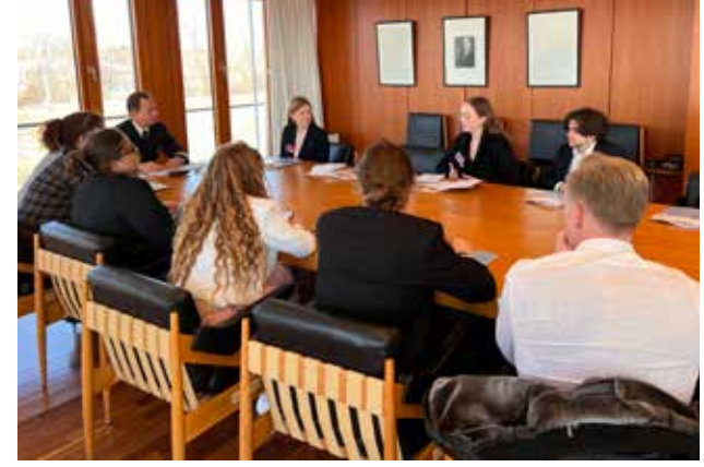
Discussion with Admiral Ristau at German Embassy