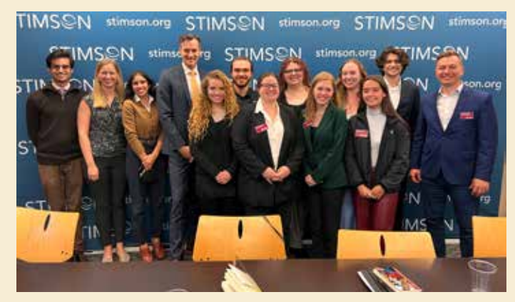
Global Ambassadors at Stimson Center