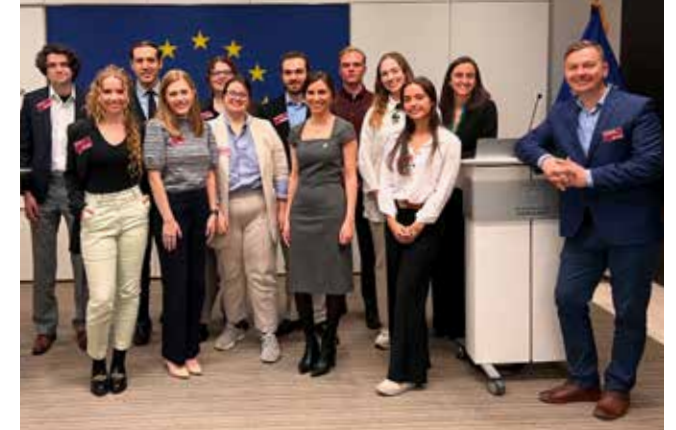
Global Ambassadors at the EU Delegation to the US