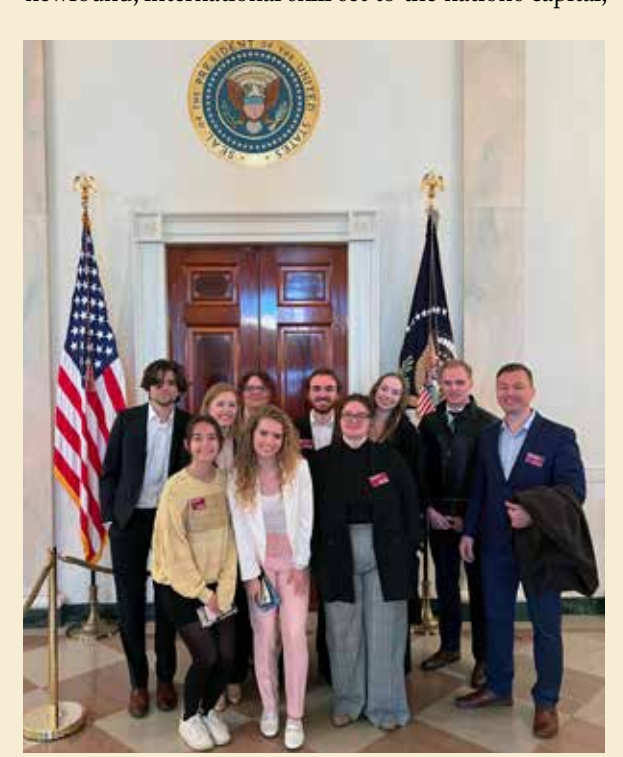
Touring the White House

The year-long Global Ambassadors Program allows internationally minded students to explore governmental and non-governmental career opportunities. Our studies included unique interactions with guest speakers, writing foreign service-style memos covering current events abroad, and learning about foreign policy and international theories through the prism of zombie apocalypse. The field trip to Washington, DC, is often described as the pinnacle of the program – yet in our opinion, this could be the world's biggest understatement. We brought our newfound, international skill set to the nation's capital,