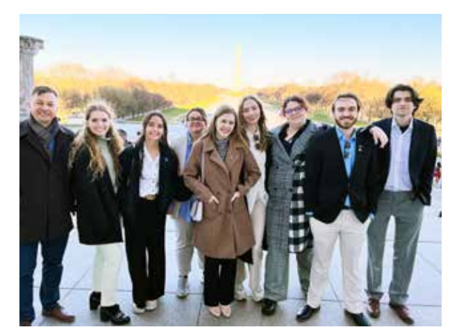
Global Ambassadors at Washington Monument